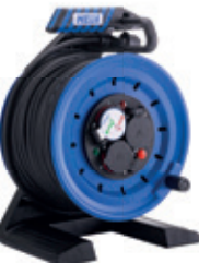
With neoprene-rubber cable H07RN-F for permanent outdoor use