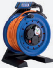
With armoured cable H07BQ-F extremely robust cable for permanent outdoor use