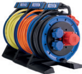
In three-phase AC version With neoprene-rubber cable H07RN-F for permanent outdoor use