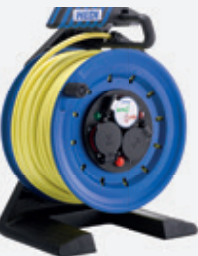
With armoured cable AT-N07V3V3-F extremely robust cable for permanent outdoor use