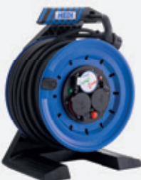
With rubber cable H05RR-F for short-term outdoor use